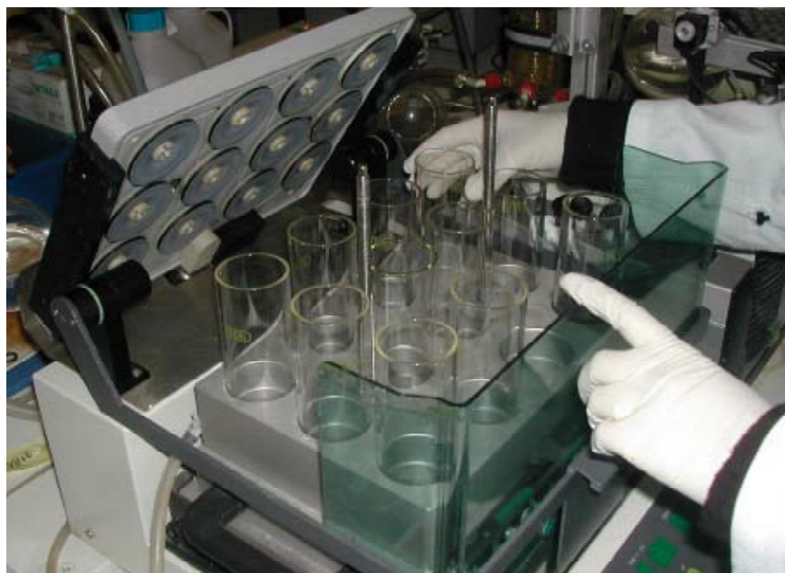
Fig.1: Syncore Analyst R-12 for parallel evaporation of 12 samples to a pre-defined residual volume of 1 ml.

Hence, the Syncore Analyst® is evaluated in terms of efficiency, i.e. high recovery rates, accuracy, convenience and speed.